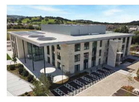
Ecclesiastical's office in Gloucester

We are part of the Benefact Group which is a family of award-winning, specialist financial services businesses that, from its profits, gives to good causes in order to transform lives and communities.